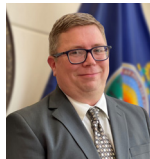
Andrew Brown HOPE AND HUMANITARIAN AWARD