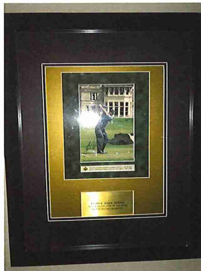
Tiger Woods Autograph Picture Frame