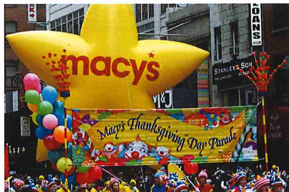
Macy's Thanksgiving Day Parade & VIP Section